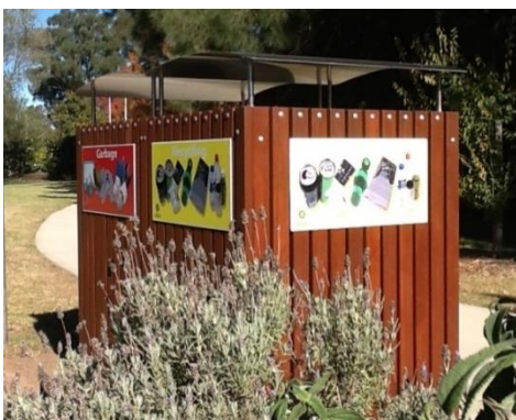
EM227 240L twin unit & signage options