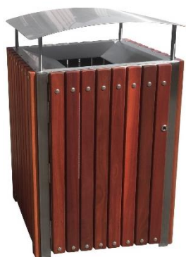
EM227 with stainless steel frame option